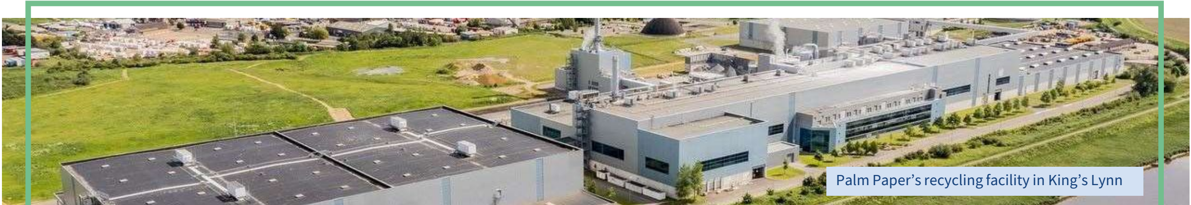
Palm Paper's recycling facility in King's Lynn

Our objective is that EnviraBoard will become the definitive sustainable building board for the construction industry.